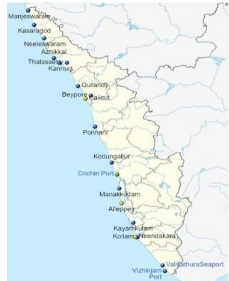
Figure 1: Minor Ports under KMB

Vizhinjam, Beypore, Kollam, and Azhikkal, all non-major ports under the Kerala Maritime Board, play crucial roles in the region's maritime network. Vizhinjam has hosted over 20 foreign cruise vessels since 2009, bringing in more than 3,350 foreign passengers, while Beypore, with an annual average of 10,000 passengers, serves significant maritime traffic to and from the Lakshadweep Islands. Kollam, a historic port town on the Arabian Coast, handles coastal and ocean-going traffic for various commodities such as rice, coconut, cashew, and minerals. Located near Kannur Town, Azhikkal benefits from a rich hinterland and essential urban infrastructure, making these ports vital to regional connectivity and trade.