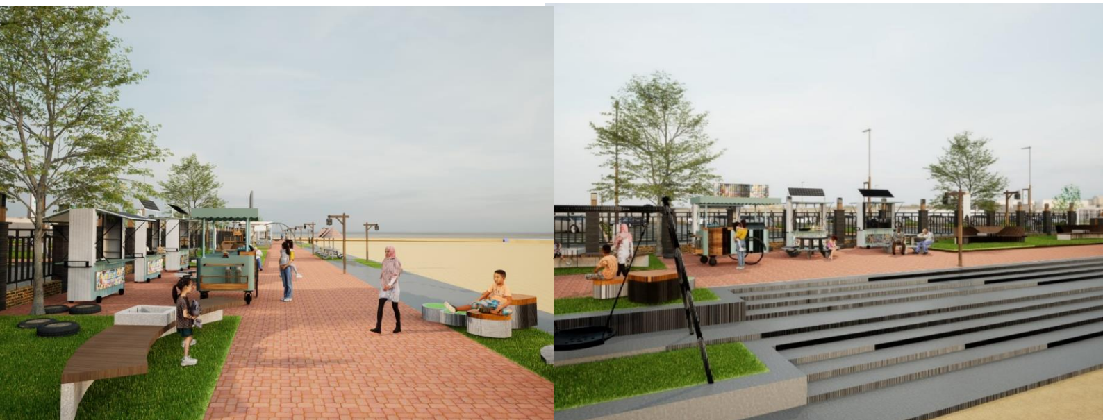
Figure 3: Representative image of the site with kiosks and promenade.