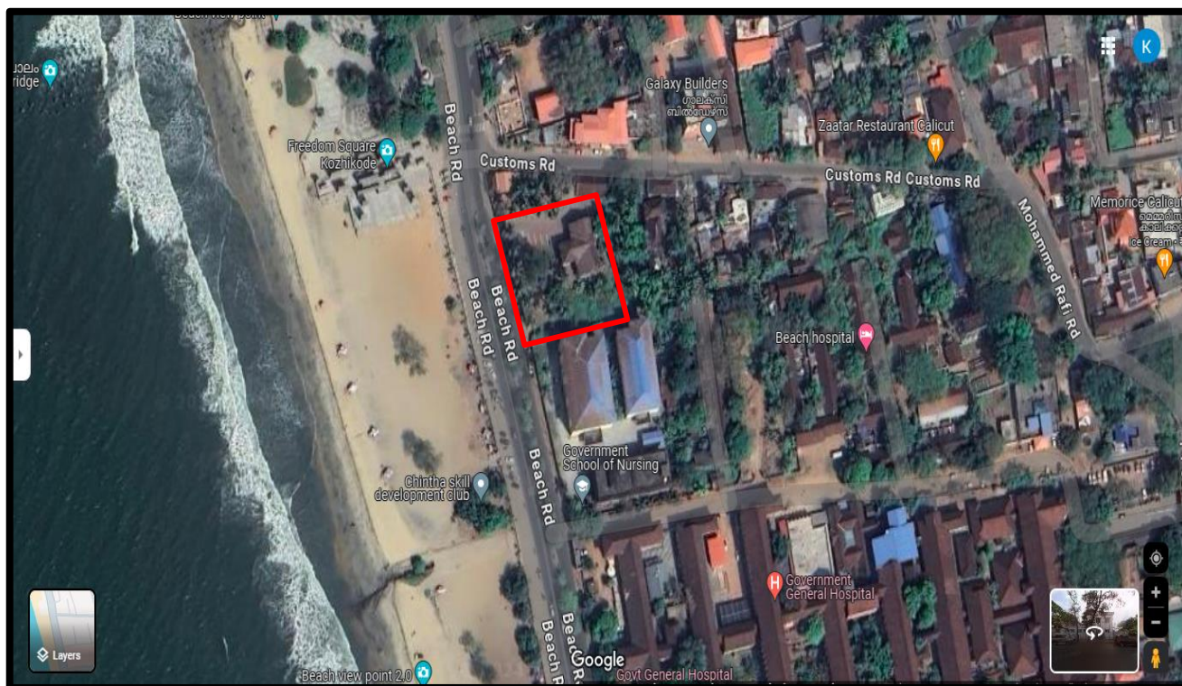
Figure 1: Beach Side Property-Google map view